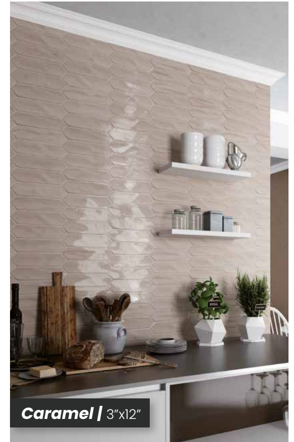
Caramel | 3"x12"