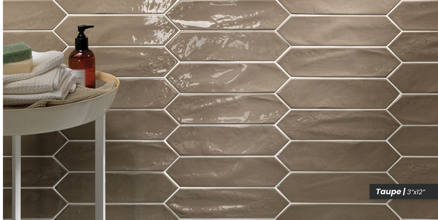
Taupe | 3"x12"