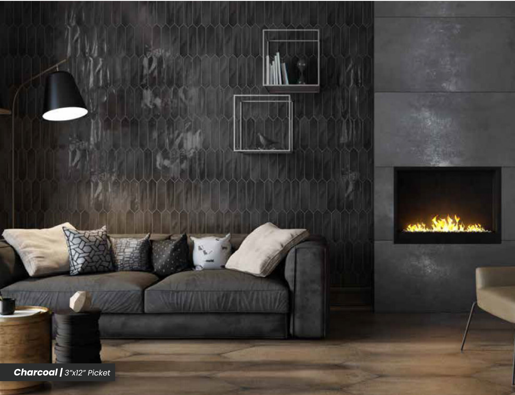
Charcoal | 3"x12" Picket